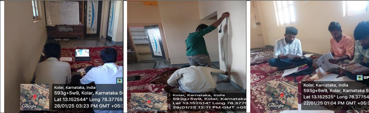
4 th Field Data Collector's Training