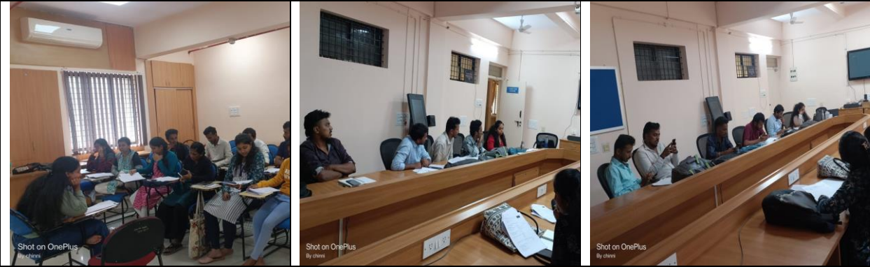
3 rd Field Data Collector's Training